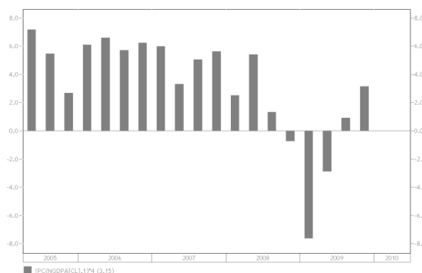
German GDP, Quarterly Mar 05 - Dec 09