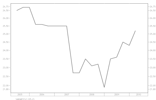
US Unemployment Rate, Quarterly Mar 05 - Mar 10