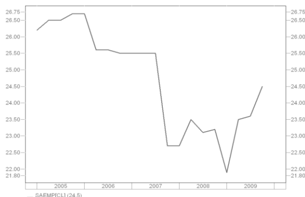
Federal Funds Rate, Monthly Dec 04 - Nov 09